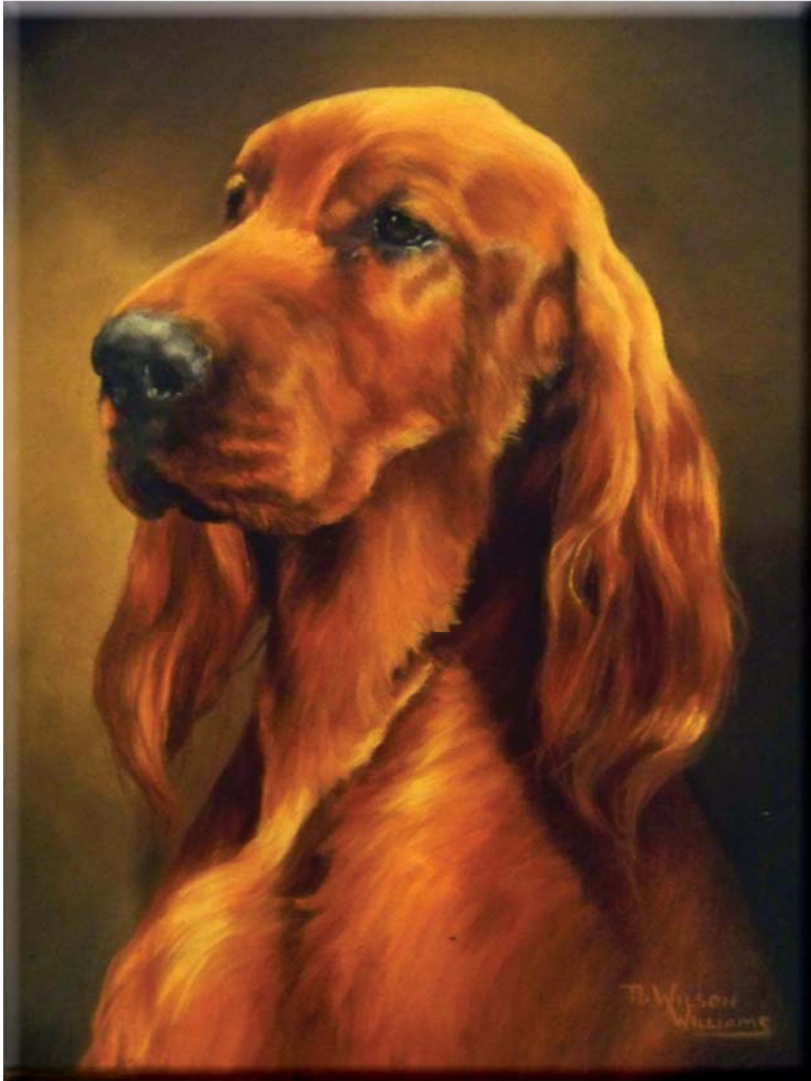
Irish Setter ~ Teddy ~ 2011 Portrait Winner