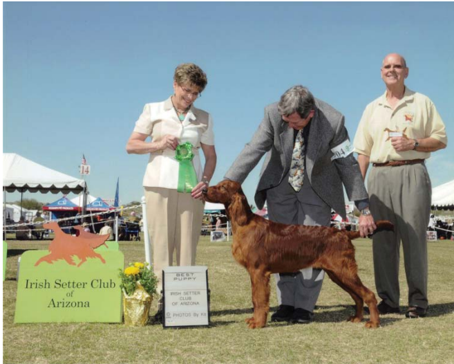
2009 - Best Puppy – 6 mos.