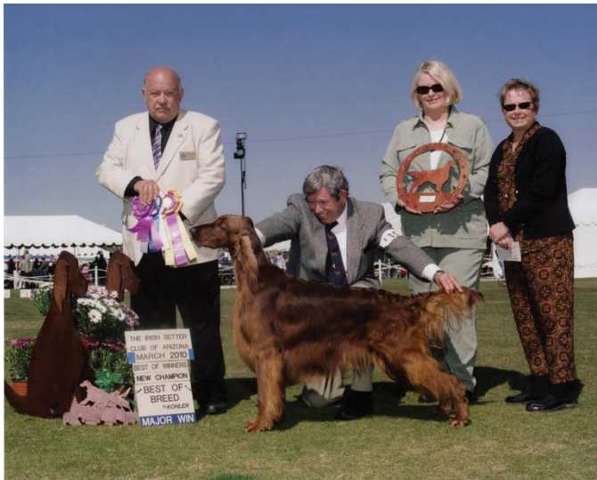
2010 - Best of Breed – 18 mos.