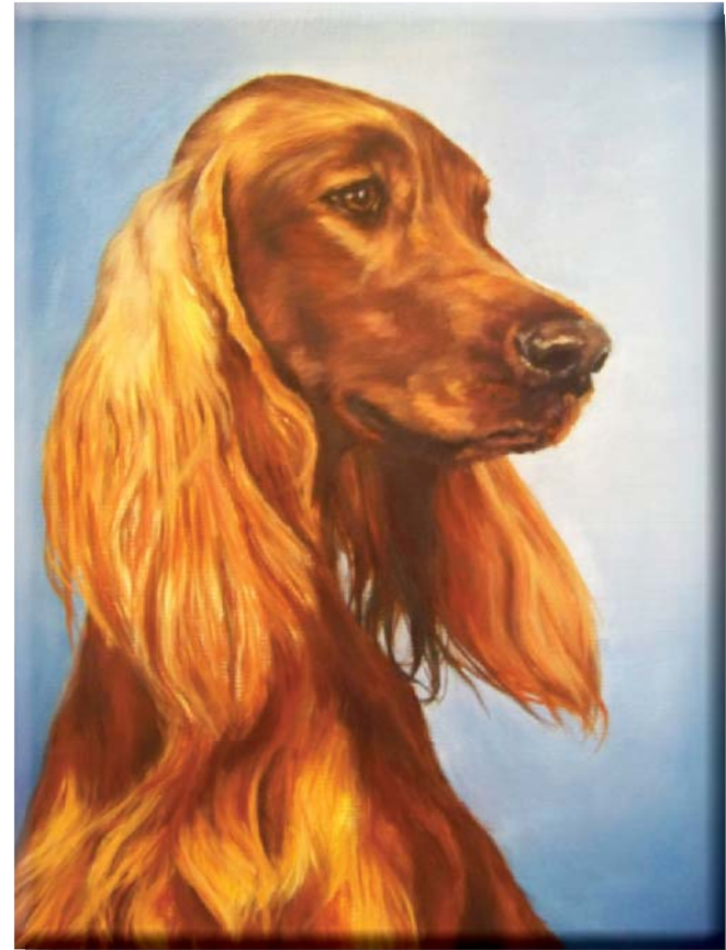
Irish Setter ~ Bailey