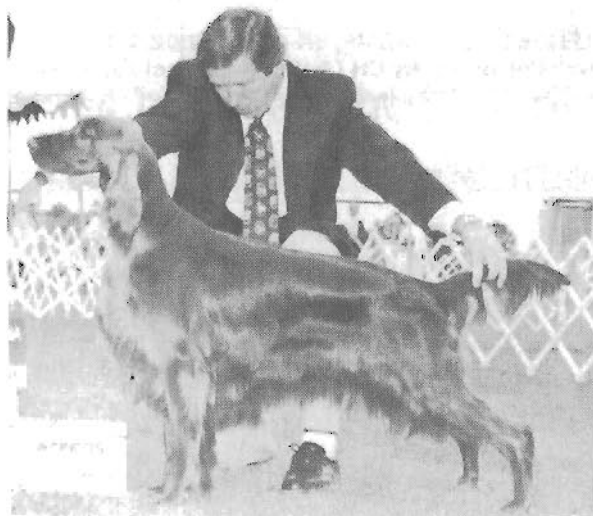
Sierra Lyn Challenge I Luv Lucy*

(Ch. Kinvale R.S.V.P. to Panda Sham ex Ch Challenge Never So Sweet)