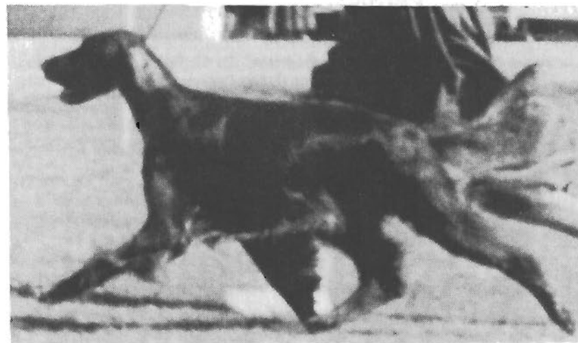
Ch. Challenge Never So Sweet

(Ch. Tramore Never Say Never ex Challenge Star Burst)