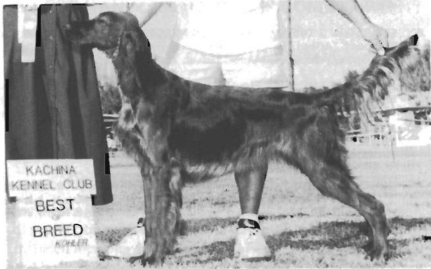
CARNELIAN WYATT'S TORCH